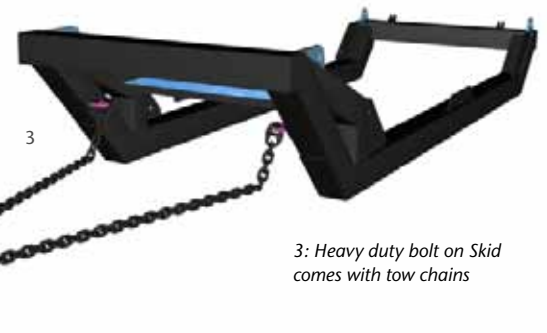
3: Heavy duty bolt on Skid comes with tow chains

Mine trailers are available for the smaller pump units. These heavy duty trailers are designed to survive the harshest of mining environments.