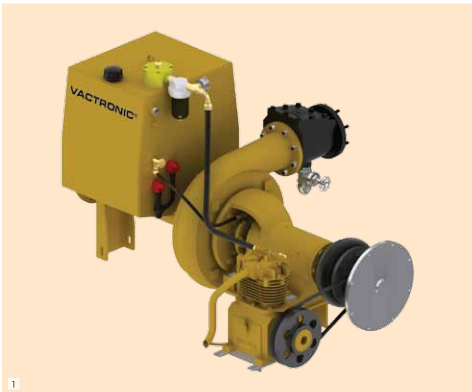
1: Typical Vactronic ® priming arrangement

Waterloss shutdown is another feature of the Vactronic ® priming system. If there is no more water to be pumped, the level in the priming tank will fall below the lower probe and activate a six minute timer to shut down the pump unit.