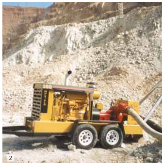
2: Trailer mounted Multiflo® MF pump at a mine in the USA