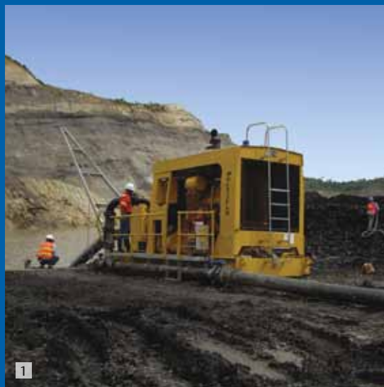
3: A Multiflo® MF-385 in action at Ok-Tedi Mine Papua New Guinea