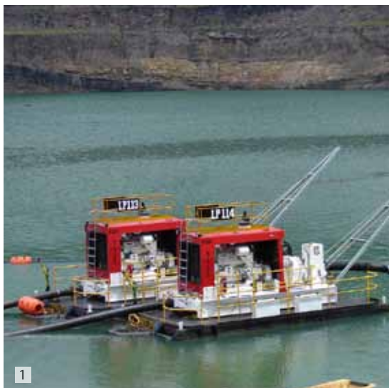
1: Pontoon mounted Multiflo® MF pump units in operation at PT KPC in Indonesia