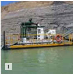
1: Multiflo® MF385 pontoon mounted pump in operation

So whatever the conditions the pump unit is operating in, Multiflo® pump units have the mounting option solutions.