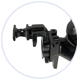
Flygt guide hook adaptor (optional extra)