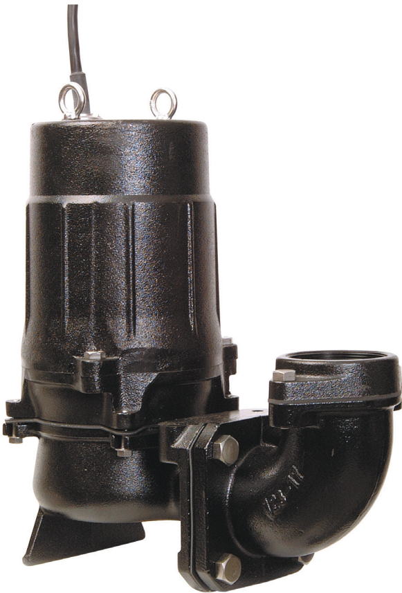
80U21.5 free-standing (elbow is an optional extra)

When a Tsurumi sewage pump is being selected as a replacement for an existing Flygt pump installation, a guide hook adaptor is available as an optional extra (see page 59). This is suitable for use with all 3" and 4" sewage pumps and permits retro-fitting a Tsurumi to existing Flygt guide rail installations.